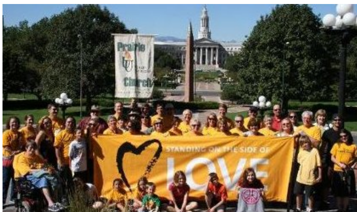
Standing on the Side of Love